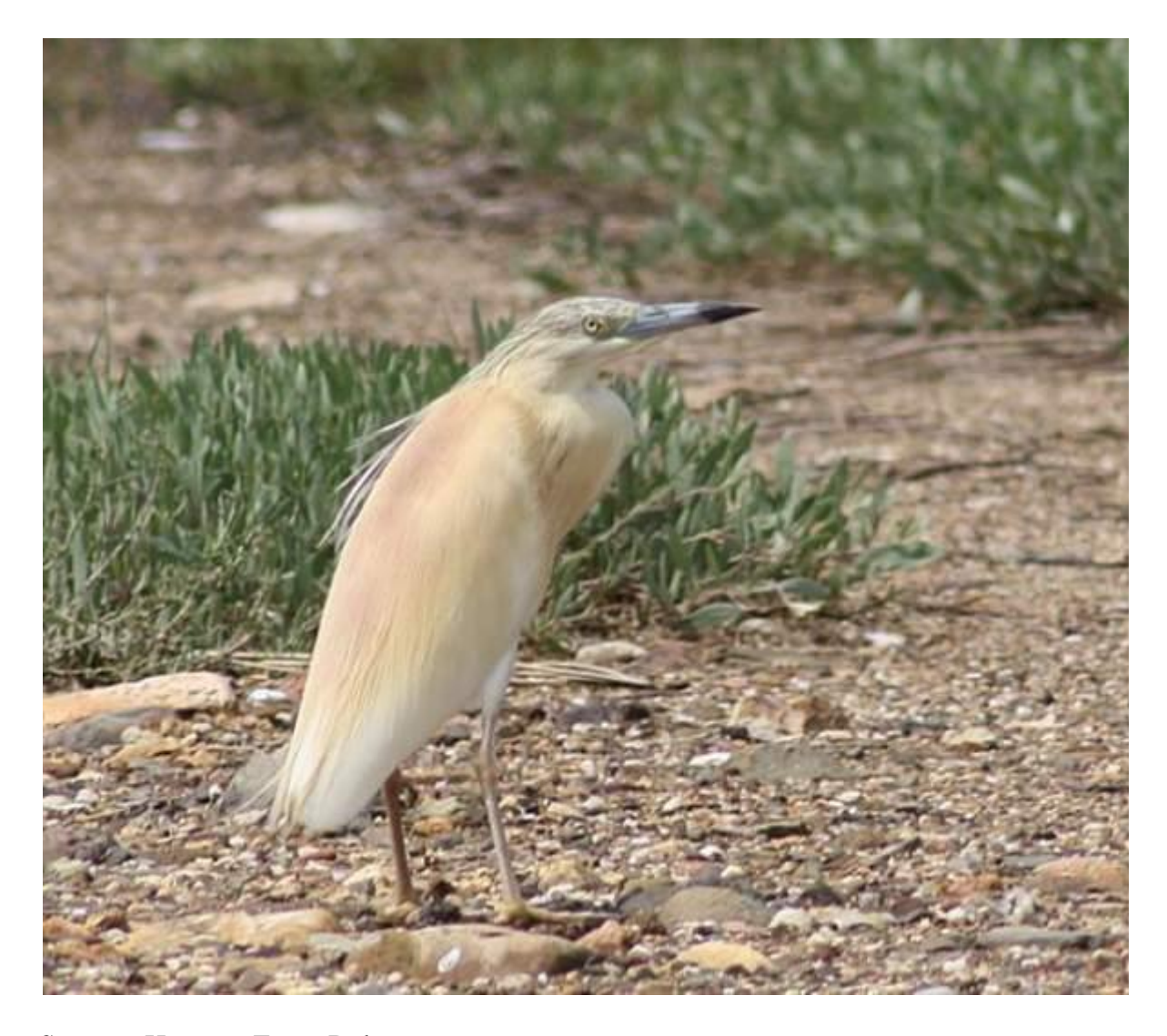
Squacco Heron at Evros Delta