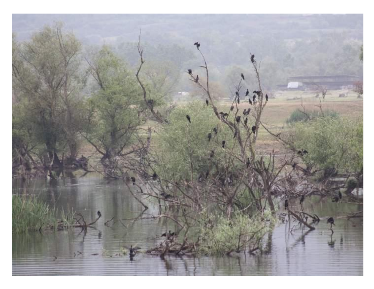
Pigmy Cormorants at Lake Kerkini