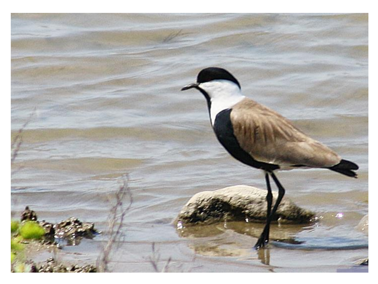
Spur-winged Plover at Evros Delta