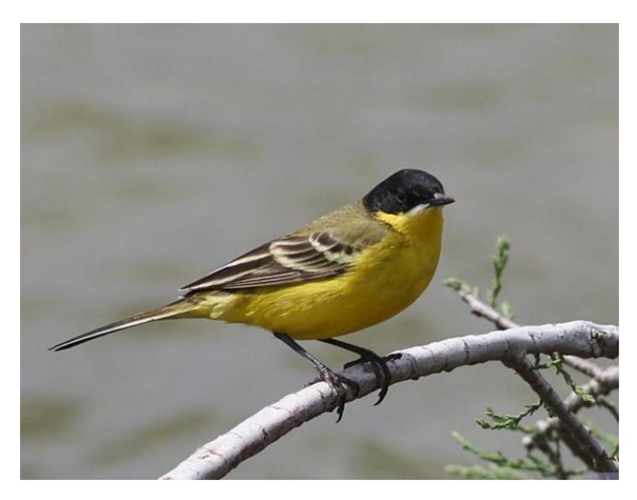
Black-headed Wagtail at Evros Delta