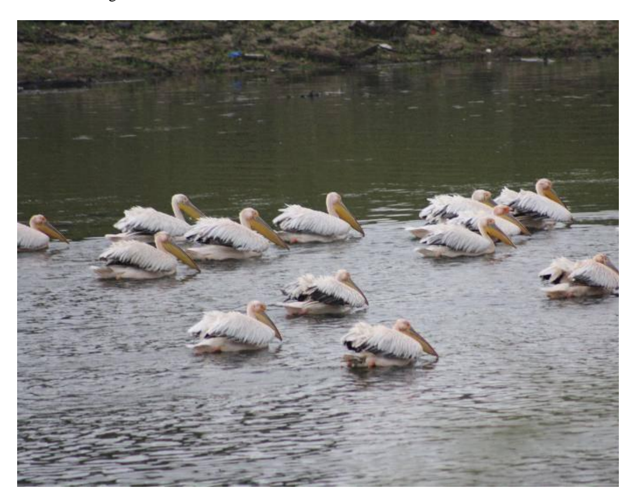
White pelicans at Lake Kerkini