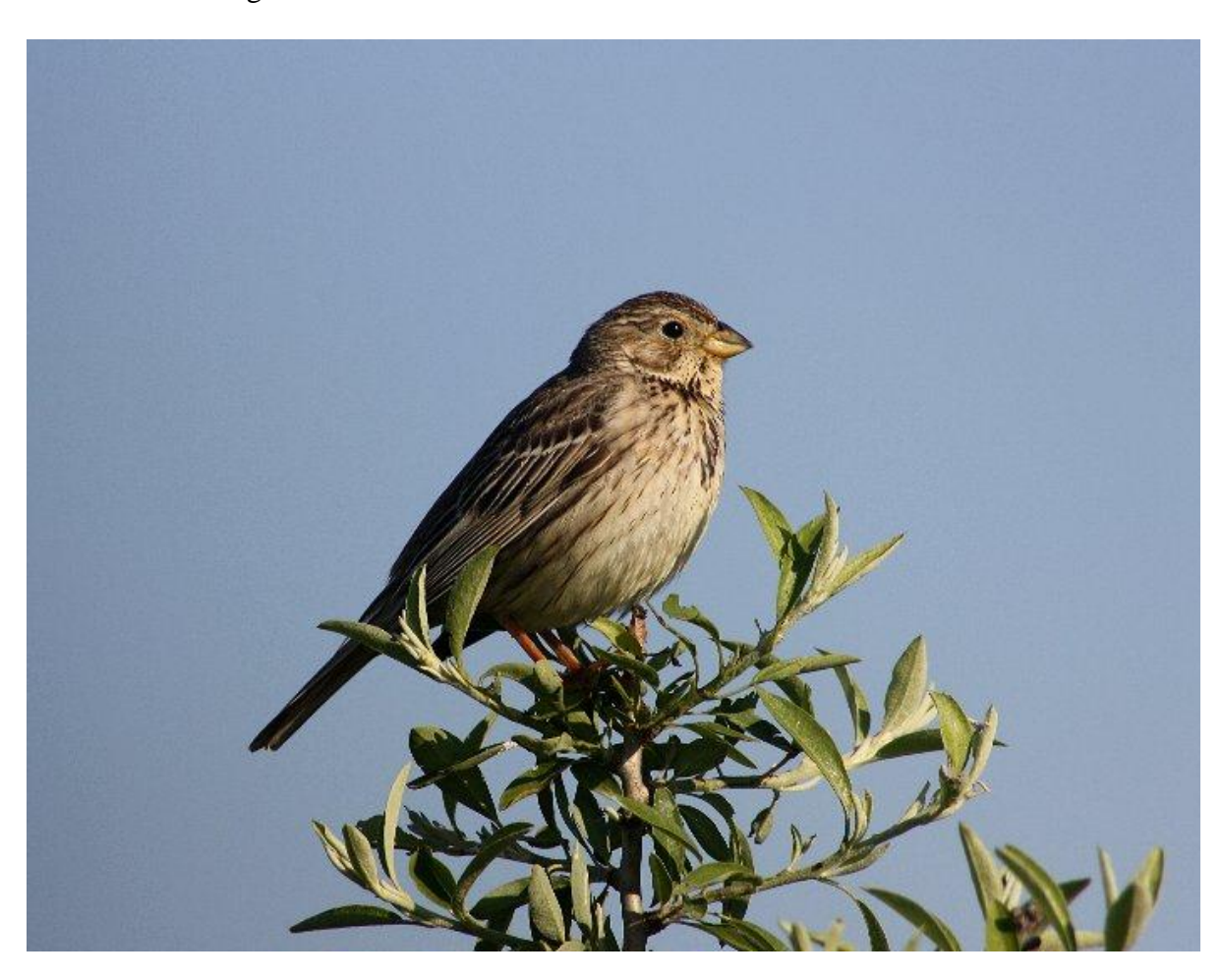
Corn Bunting at Evros Delta