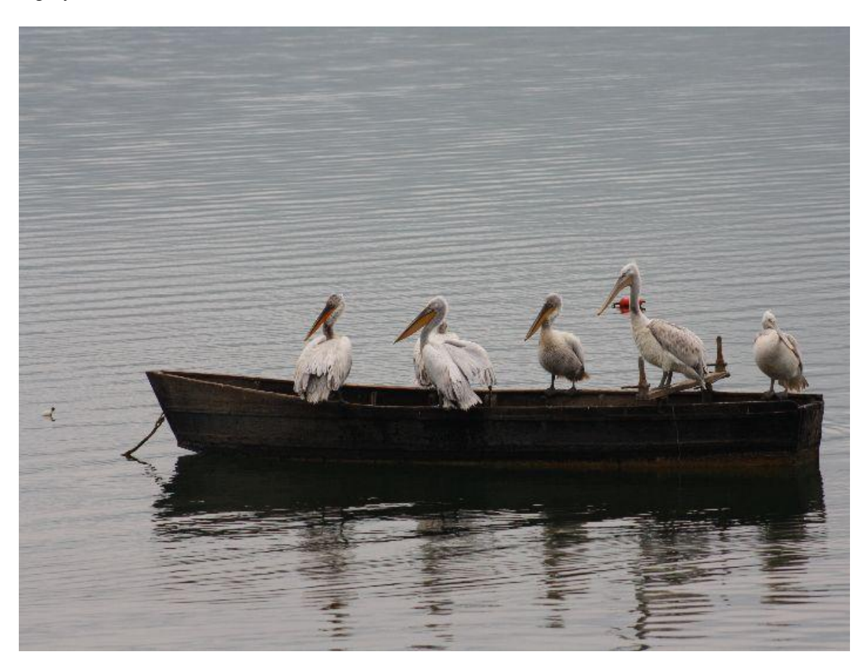
Dalmatian Pelicans at Lake Kerkini