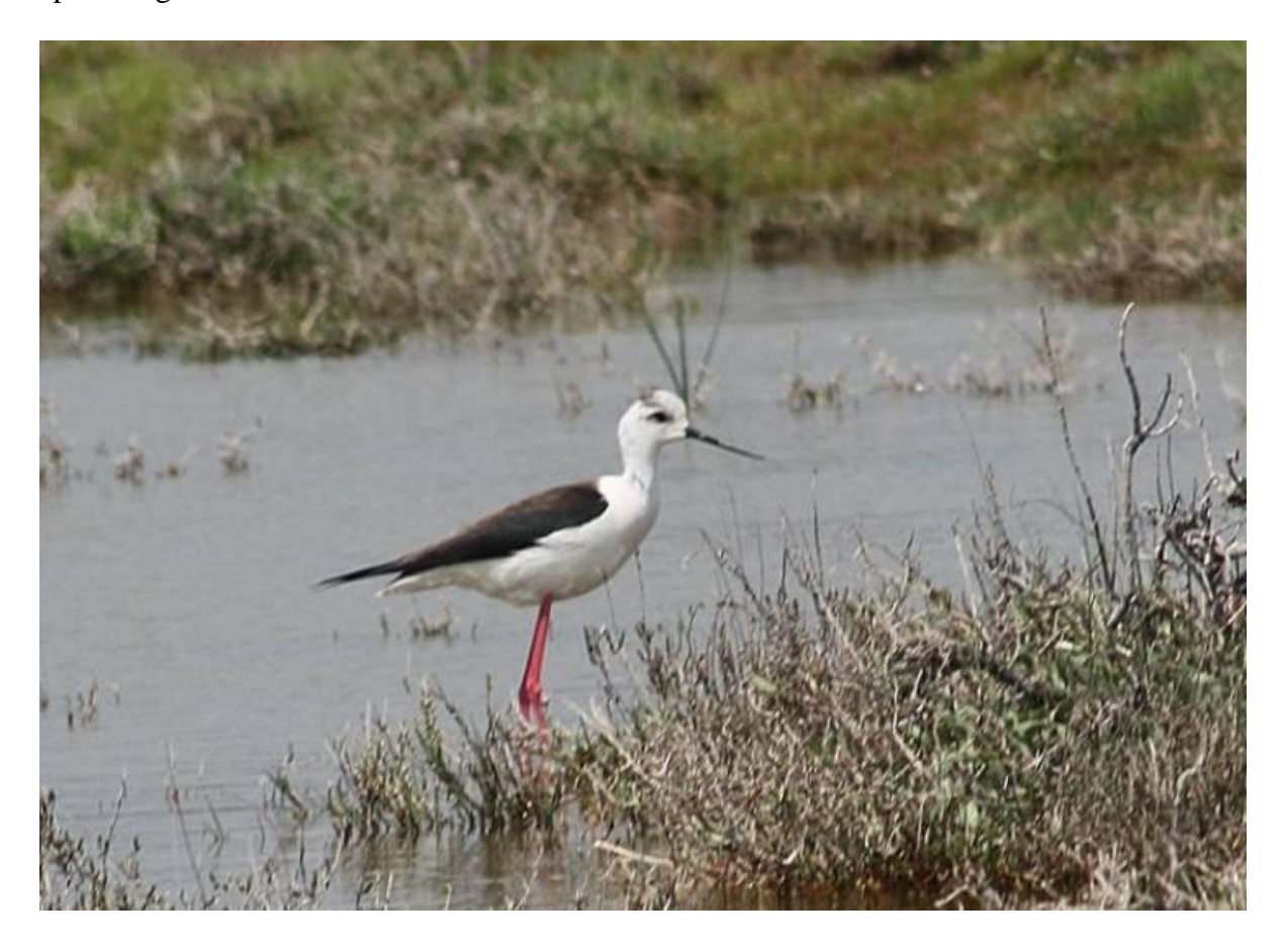
Black-winged Stilt at Evros Delta